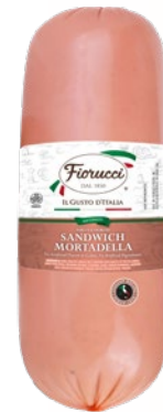
SANDWICH MORTADELLA #50456

Crafted in the fine Italian style, this mortadella uses select cuts of meats that are blended with imported spices and slow-roasted—giving it a soft, buttery mouth feel and flavor. Fiorucci Mortadella is available with or without pistachios.